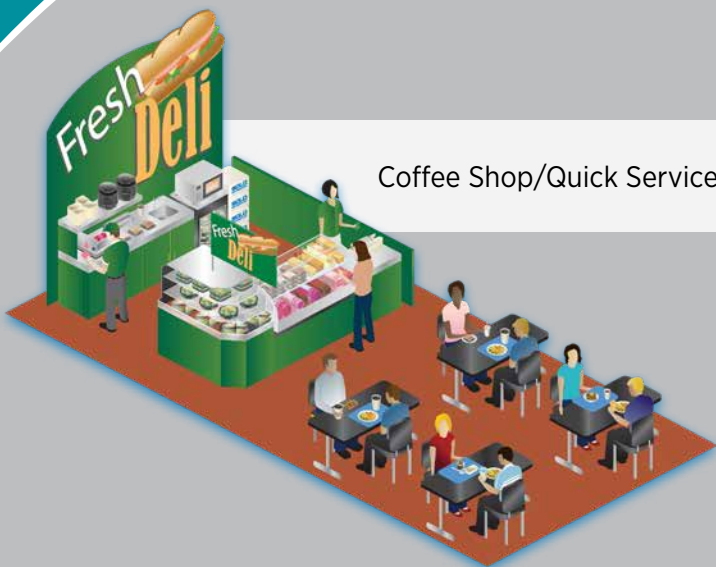
Coffee Shop/Quick Service