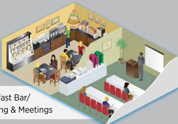
Breakfast Bar/ Catering & Meetings